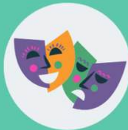
Changes in facial expressions